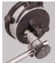
No. 657Y Indicator Attachment shown with lug-on-center back.