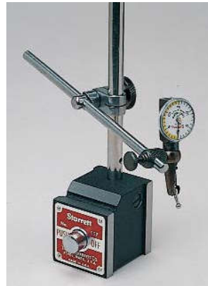
No. 657AA with No. 711FS Last Word Dial Test Indicator.