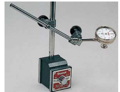
Shown with No. 196B1 Universal Dial Indicator.